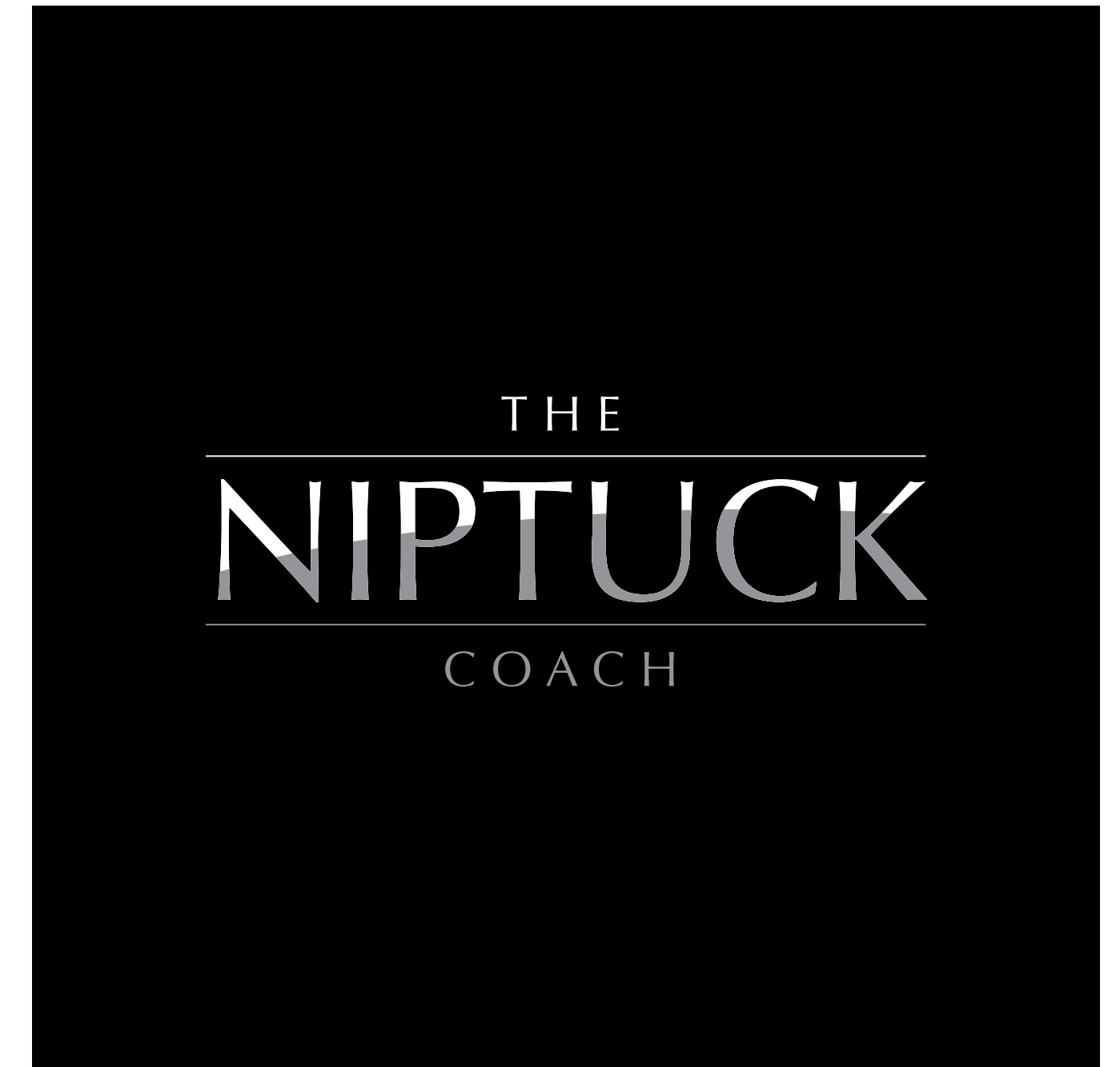
Black and white version